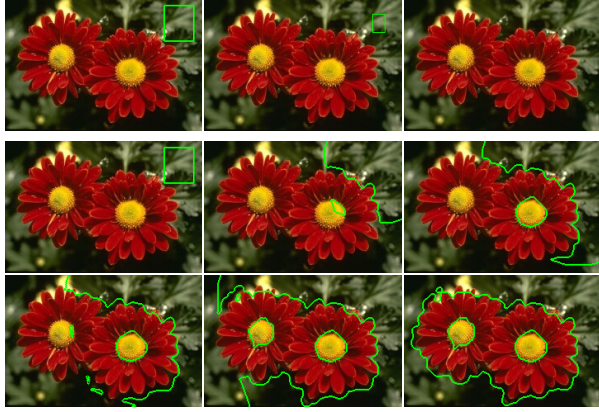
Figure 1. (1st row) Segmentation result using conventional level set; (2nd row and continuing on 3rd row) Results using proposed method.

Instead of solving the PDE problem in (3) using FDM with the upwind scheme, we interpolate the level set function \Phi(\mathbf{x}) using a number of RBFs and evolve it by adapting the expansion coefficients. The RBF interpolation is expressed as: \Phi(\mathbf{x}) = p(\mathbf{x}) + \sum_{i=1}^N \alpha_i \psi_i(\mathbf{x}) , where \psi_i denote a RBF function, N denotes the number of RBFs, p(\mathbf{x}) is a first-degree polynomial p(\mathbf{x}) = p_0 + p_1x + p_2y , and \alpha_i are the expansion coefficients. Assuming time and space are separable, the time dependence of the level set function is now due to the RBF interpolation, whose evolution is achieved by solving the following ODE: