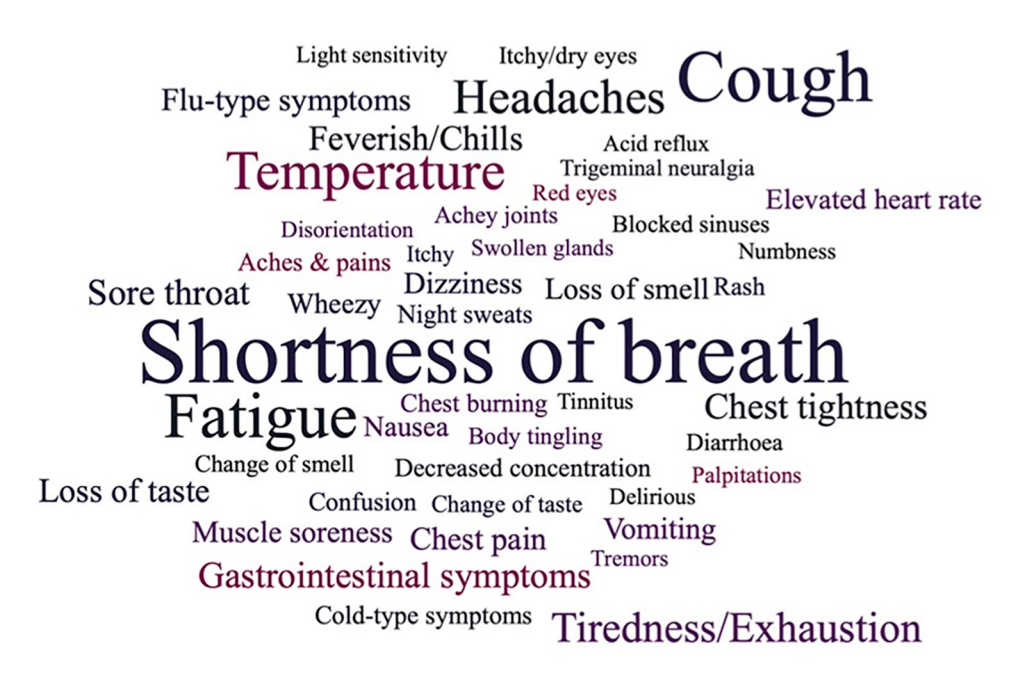
Fig 1. Word cloud illustrating the frequency and array of different symptoms reported within the acute phase of participant experiences.

https://doi.org/10.1371/journal.pone.0284710.g001