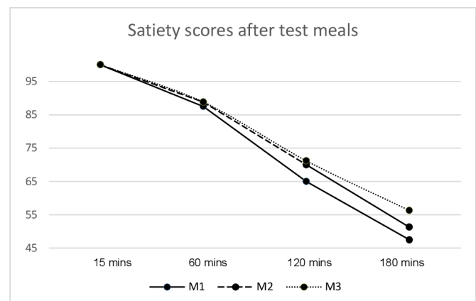
Figure 2 Satiety scores after test meals.

Rice is the staple food in Sri Lanka. Furthermore, coconut ‘milk’ and coconut oil are also used very commonly to prepare food. There is unpublished evidence to suggest that the addition of coconut oil during cooking and cooling of rice increases its RS content by as much as 10 times. 20 During this process, amylose lipid complexes are formed which undergo crystallisation during cooling. Cooling and subsequent reheating further increases RS