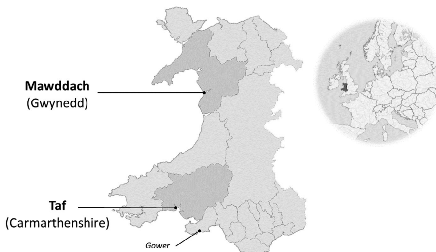
FIGURE 1 The location of our case sites in Wales, UK. Adapted from Roberts et al. (2021), based on Wales_location_map.svg by NordNordWest, used under CC BY-SA 3.0 and Wales in Europe 2.svg by Llywelyn2000, used under CC BY-SA 4.0. The Gower Peninsula, referred to by some participants, is also shown

While the Taf and the Mawddach rivers both flow through varied landscapes to form wide, sandy estuaries of similar size and shape (Roberts et al., 2021), they lie in distinct sediment cells and are thus subject to different Shoreline Management Plans (Ballinger & Dodds, 2020). Indeed, the approaches to coastal management—and local responses to these—have been quite different in the two locations. Notably, at Laugharne (Taf), where there is a policy of managed realignment, the local community rejected the construction of a surge barrier due to aesthetic concerns (Roberts et al., 2021; South Wales Coastal Group, 2012). At Fairbourne (Mawddach), the policy