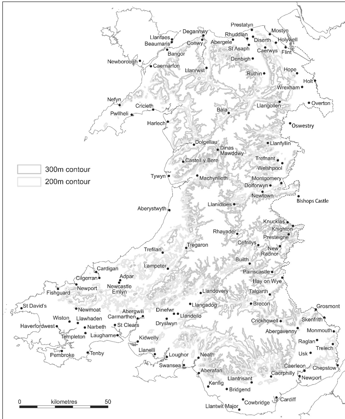
Fig. 2. The urban network in medieval Wales. Source: based on M. F. Stevens, The Economy of Medieval Wales, 1067–1536 (Cardiff, University of Wales Press, 2019), p. 13, ‘Map 3. The towns of fourteenth-century Wales’.