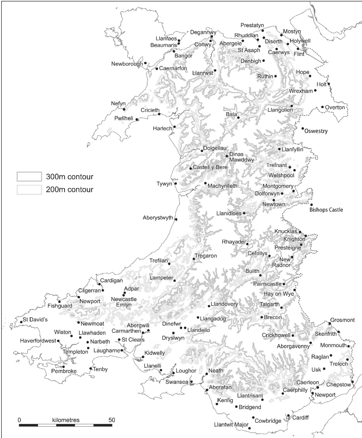
Fig. 2. The urban network in medieval Wales.

Source: based on M. F. Stevens, The Economy of Medieval Wales, 1067–1536 (Cardiff, University of Wales Press, 2019), p. 13, ‘Map 3. The towns of fourteenth-century Wales’.