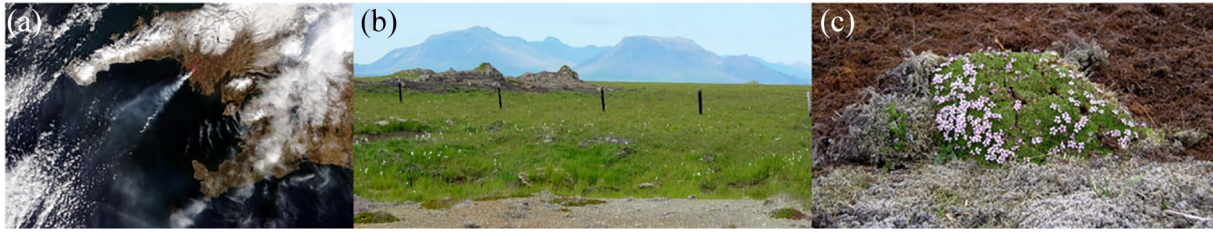
Figure 2. (a) The Myrar wildland fire on 30 March 2006 at 12:55 (image from NASA/MODIS), (b) Myrar 24 July 2006, and (c) edge of a moss fire in June 2007 (Photos: Throstur Thorsteinsson).

lowland coniferous plantations, fire damage can be significant (Szatmári et al., 2016). Human-induced fire, which is generally ignited unintentionally, is the major cause of wildland fires. Arson, for example, affects approximately 10 000 ha of grassland per year (Deak et al., 2014). Prescribed burning is scarcely applied due to legislative constraints, even though in grasslands it may present a feasible solution for several conservation challenges, for example, for increasing landscape-scale diversity, creating habitats for specialist species or for decreasing the amount of accumulated litter (Deak et al., 2014) and also for the protection of the endangered great bustard (Végvári et al., 2016).