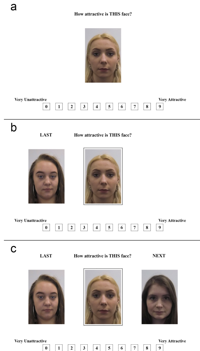
Figure 1. An illustration of the ratings task for three of our experiments. The number of images presented onscreen at a given time differed across (a) Experiment 1, (b) Experiment 2, and (c) Experiment 3.

Rather than the current image simply being replaced with the next image after a response was given, the face was shown to move left and off the screen as the next image in the sequence moved on to the screen from the right-hand side, appearing similar to a conveyor belt. Once the face arrived in the centre of the screen, participants were able to