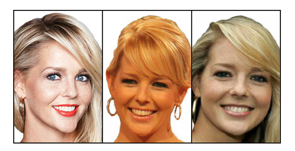
Figure 1. Example stimuli used in the experiment.