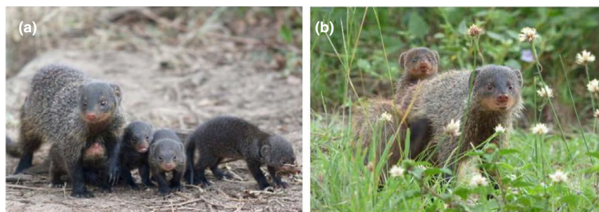
Fig. 1 Banded mongoose caring behaviour. (a) Babysitting, where one or more adults remain at the den to protect all pups in the communal litter; and (b) escorting, where an adult provides one-to-one care for a single pup over a 2-month period.

Reproduction is highly synchronised within social groups, with up to 13 females (median = 3) giving birth together in an