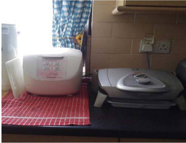
Plate A2. Farid's house has got rice cooker and grilled machine next to each other