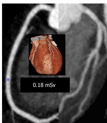
Figure 2 Coronary computed tomography angiography examination with image quality score 4 performed in a 52 years old female patient with heart rate of 56 bpm with a dose of 0.18 mSv.

adaptively apply noise correction at a reduced X-ray exposure without compromising spatial resolution [14] . AIDR and more recently 3D AIDR (AIDR3D) decreases image noise thus allowing for reductions in tube current while preserving overall image quality [15] . BMI-adapted tube voltage and current work synergistically with AIDR3D to reduce image noise while achieving a 75% radiation dose reduction relative to a scan reconstructed with filtered back-projection [16] .