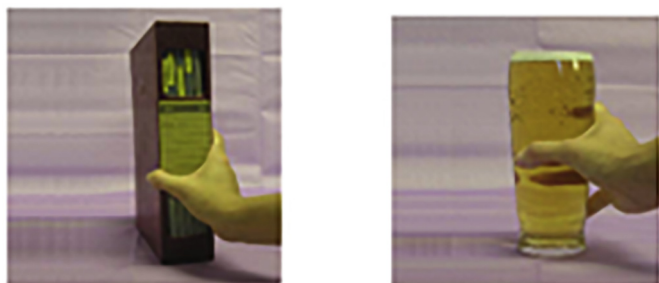
Fig. 1. An example of a trial from the eye-tracking task. The stimulus on the right depicts a hand reaching for a pint of lager. The stimulus on the left is a carefully matched control stimulus that depicts a hand reaching for a folder. Note, the stimuli used in the task were in full colour.

*Note, MDMA consumption is lifetime usage, whereas alcohol consumption is weekly usage.