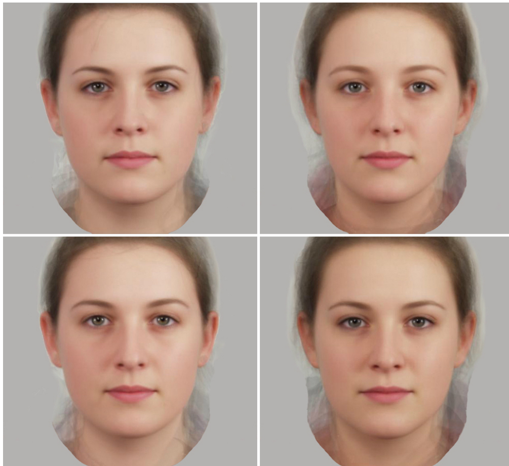
Figure 1. The composite faces used in the study. Low-level trait composites appear in the left column (named ‘Mary’ in the IAT), and high-level trait composites appear on the right (named ‘Jane’ in the IAT). Top row: Agreeableness, bottom row: Extraversion.

Across all PIF-IAT studies, high Agreeableness and Extraversion faces were named ‘Jane’ and their low counterparts were named ‘Mary’. Composite faces are shown in Figure 1.