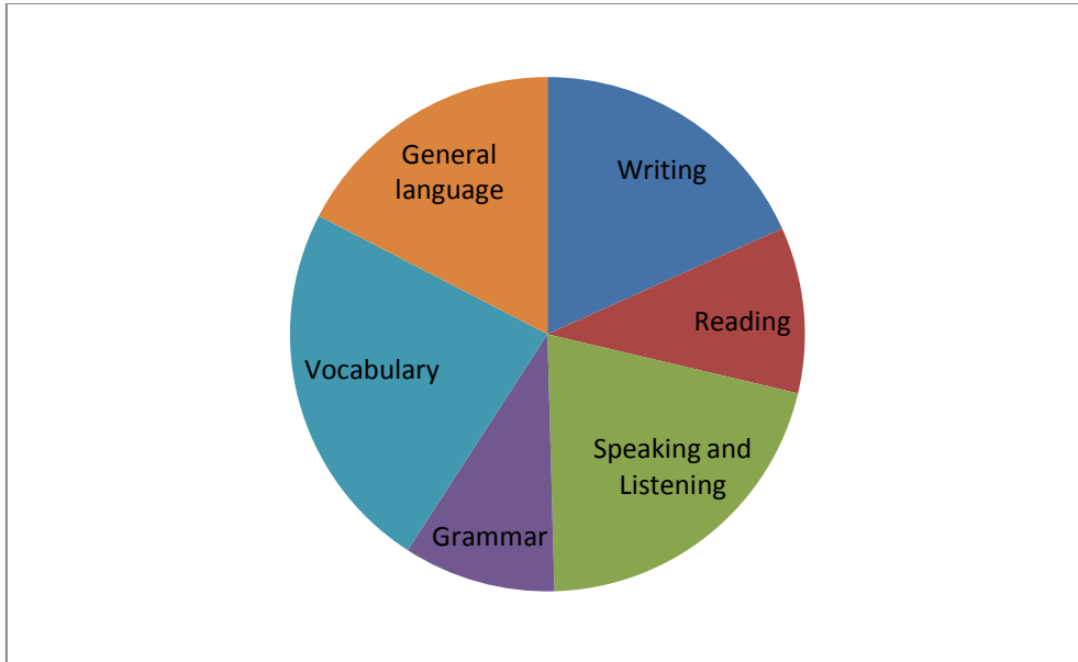
Figure 3.2: Distribution by competence of items included in the synthesis of evidence