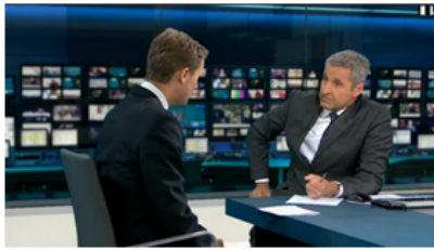
Figure 8. ITV1 report on 7/5/14