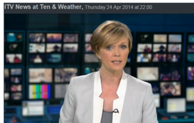
Figure 7. ITV1 report on 24/04/14

Barclays has suffered one of its worse shareholder revolts over its pay and bonuses. The bank's bosses were shouted at by those who don't like bonuses going up when profits, and their dividends, are going down. One big shareholder was pretty fed up too; our business editor Joel Hills witnessed the Barclays bonus backlash.