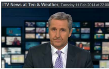
Figure 4. ITV1's report on Barclays on 11/2/14

There is fierce criticism of Barclays tonight after announcing a 10% hike in bonuses for top staff, and a steep fall in profits. It has also confirmed plans to shed 7,000 jobs in the UK. Shares in the bank have fallen and today the Institute of Directors questioned whose interests are being served by the Barclays decisions.