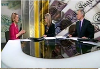
Figure 3. ITV's report about executive remuneration at Aviva in May, 2012