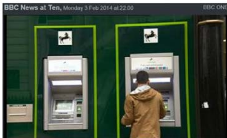
Figure 12. BBC1's report on the Lloyds Banking Group story on 3/2/14.