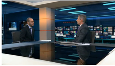
Figure 5. The conclusion of ITV1's report on Barclays on 11/2/14