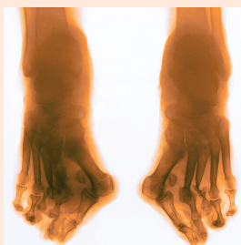
X-ray showing Charcot foot deformity

Charcot foot can be diagnosed early through patient history, examination and X-rays. Non-surgical treatment options include immobilisation, braces or custom shoes, and offloading pressure to help stop bone destruction (Banks, 2013).