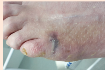
1c. Foot after nine weeks

After four days of larval therapy, the larvae were removed, revealing a fully debrided wound and an exposed tendon. Swelling and inflammation also appeared to have diminished.