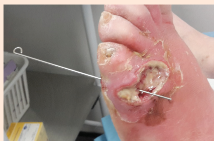
1a. Foot before treatment

After initial assessment of the wound, larval therapy was discussed with the patient and it was agreed that this was the best treatment option.