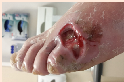
1b. Foot after four days

After initial assessment of the wound, larval therapy was discussed with the patient and it was agreed that this was the best treatment option.