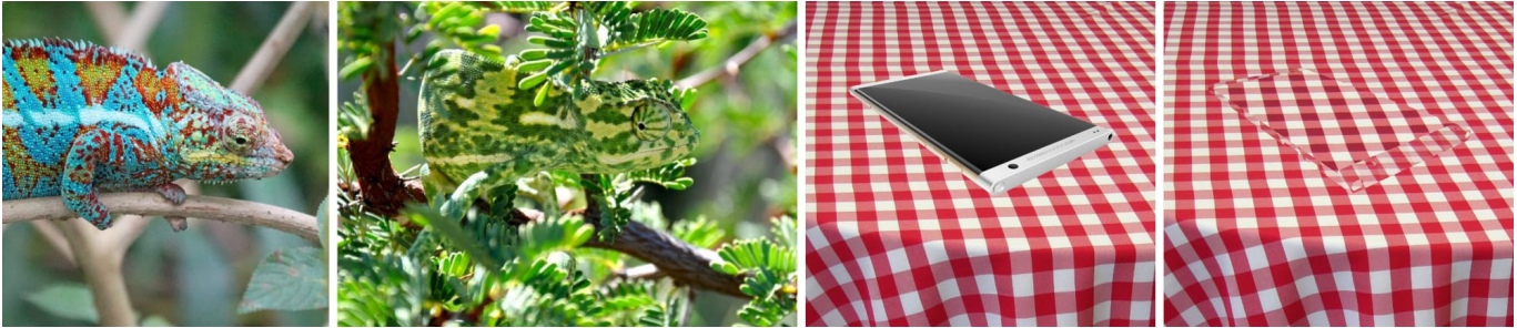
Figure 1. Chameleons are well known for their ability to change the colour of their skin for survival and social signalling [10]. Sometimes this colour change is to indicate aggression towards other animals, or in response to temperature or mood (left); at other times, as in the centre left image shown here, chameleons can match the pattern of their surroundings near perfectly, perhaps to lessen the danger from predators. In this work, we explore how mobile devices might be able to perform the same feat. The centre right image, then, shows a phone placed normally on a table. At right: the same phone blended in to its surroundings, but still able to present social signals to its owner in a subtle manner.

3 Interact Lab University of Sussex, UK { d.sahoo, sriram } @sussex.ac.uk