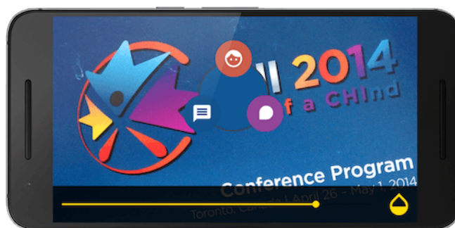
Figure 6. Interaction with the deployed Chameleon Phone prototype. After taking a photo of a surface, the app automatically zooms the image as the user sets down the phone (the user can then pan or zoom the display for perfect alignment). The app automatically assigns the three main colours found in the image to Facebook, SMS and WhatsApp notifications. If desired, the user can select their own choices via a colour loupe (the popup shown in the centre of the screen), or adjust the brightness of the image to more closely match the surrounding surface (slider at bottom). When a notification is received from one of the three linked apps, the corresponding colour in the image will glow, as shown in Fig. 3.

To further evaluate the chameleon notion, we wanted to explore how the concept resonated with users in a more natural environment, providing further use-case scenarios and improvements to the updated prototype design. With this in mind, we deployed the second version of the Chameleon Phone prototype over a period of five-weeks in each of four locations. Three of these regions were where we knew safety and security was an issue for local residents; that is, people drawn from communities in Langa, South Africa; Nairobi, Kenya; and, Mumbai, India. In addition, we also deployed it to the 10 UK participants described in the previous section.