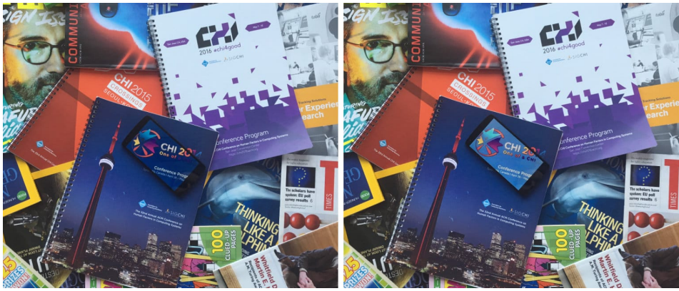
Figure 3. Optically camouflaged mobiles: hiding in plain sight on everyday objects.

Left: the Chameleon Phone probe “camouflaged” on a patterned surface. While the outer fascia of the phone is still visible, the screen displays an exact replica of the object underneath.