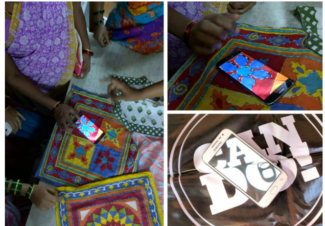
Figure 4. The initial Chameleon Phone probe in use by participants in the studies in Dharavi (left and top right) and Langa (bottom right).

Six months after the future mobile design workshops, we carried out two further workshops with participants in Langa (Cape Town) and Dharavi (an informal settlement in Mumbai) to focus specifically on chameleon-like opportunities. We recruited 16 participants in each location (32 people in total – 15F, 17M, aged 18–50) to take part. Participants lived in communities the same as (in the case of Langa) or similar to (Dharavi) participants in the first workshops. None of the participants had taken part in the previous studies.