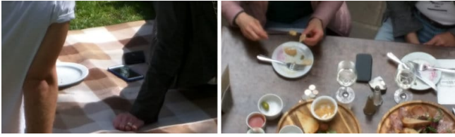
Figure 5. Opportunities for a camouflaging mobile device. Left: a phone laid on a checkered picnic rug. Right: a phone on a cluttered restaurant table. Both photos were captured in situ during our observational study.

Turning to the Chameleon Phone’s subtle notification cues, in general, participants saw the potential for subtle but informative messages. Several groups also suggested options for what the flashing colours could mean: “I would mostly use the yellow colour for incoming SMS messages. I could set different colours for different close friends” . Similarly, one participant wanted to always associate the same colour with a particular person, whereas another wanted a specific action to happen when a service provider was calling so they could avoid answering unwanted calls. Participants also liked the glowing feature in particular, prompting comments such as, “eyes are fast – in the corner of my eye I can see something glowing” .