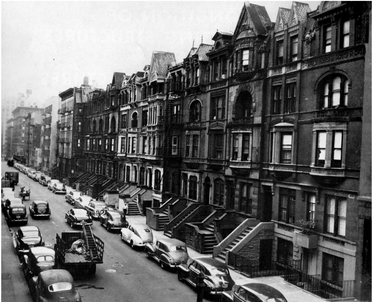
Figure 5. Buildings demonstrating “blighted” conditions in the Manhattantown slum clearance site in the Upper West Side of Manhattan.

Off-limits areas such as grass lawns were also clearly fenced off and included signs instructing people to keep away. Nothing was left to imagination.