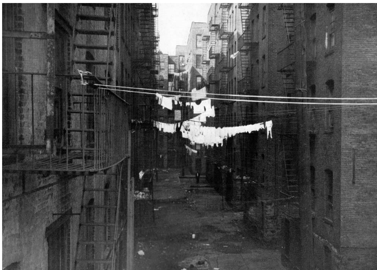
Figure 10. A back alley in the North Harlem slum clearance site. This back alley is wide enough to almost cover an entire city street. However, it is still too narrow according to the standards of modernist architecture.

indicated that portions of the buildings did not receive adequate sunlight. 42 Although the filled clotheslines symbolized a process of cleanliness, this was undermined because they were juxtaposed to the unsanitary darkness in the ground and the gray structures around them. Overall, the combination of structures, clotheslines, and garbage, exhibited a sense of visual chaos. From a public health point of view, people who existed alongside these back alleys probably lived in unhygienic conditions. The images of back alleys also asserted that the buildings of different owners were too close to each other and that no building improvement would be able to alter this. The only possible remedy was that of site clearance. A variant of the theme of the back alley was the photographing of the roofs of buildings (Figure 11). 43 The roofs of buildings were definitely not attractive, but they were cleaner than back alleys and they did not show the same degree of blight and disorder.