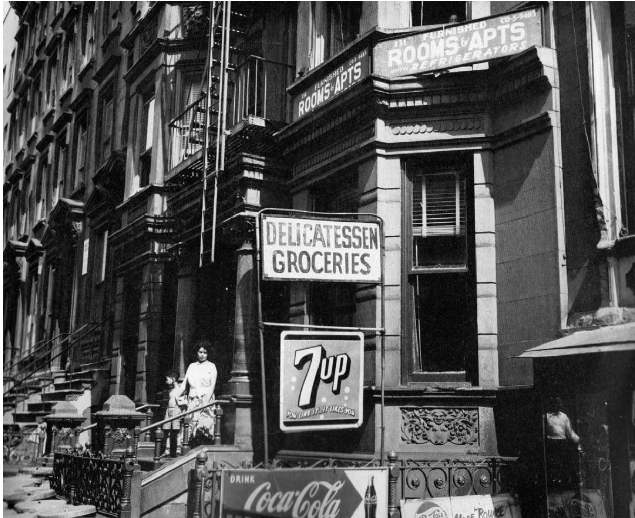
Figure 14. Brownstones with rooming houses and a grocery store in Lincoln Square.

There are stands outside the stores, but this has never been unusual in large cities. There are people who are possibly street vendors, but this is also nothing unusual either. Finally, there is a pushcart in the cobblestone street, which probably belongs to a street vendor. In the 1930s and early 1940s, the City of New York went after street vendors and their pushcarts and attempted to eliminate them. 49 This was viewed as a modernization project and a caption of this photograph could ask the question of whether a pushcart and a cobblestone street still had a place in New York City. This photograph corresponded to the notion that inappropriate land use represented one of the main causes of urban blight.