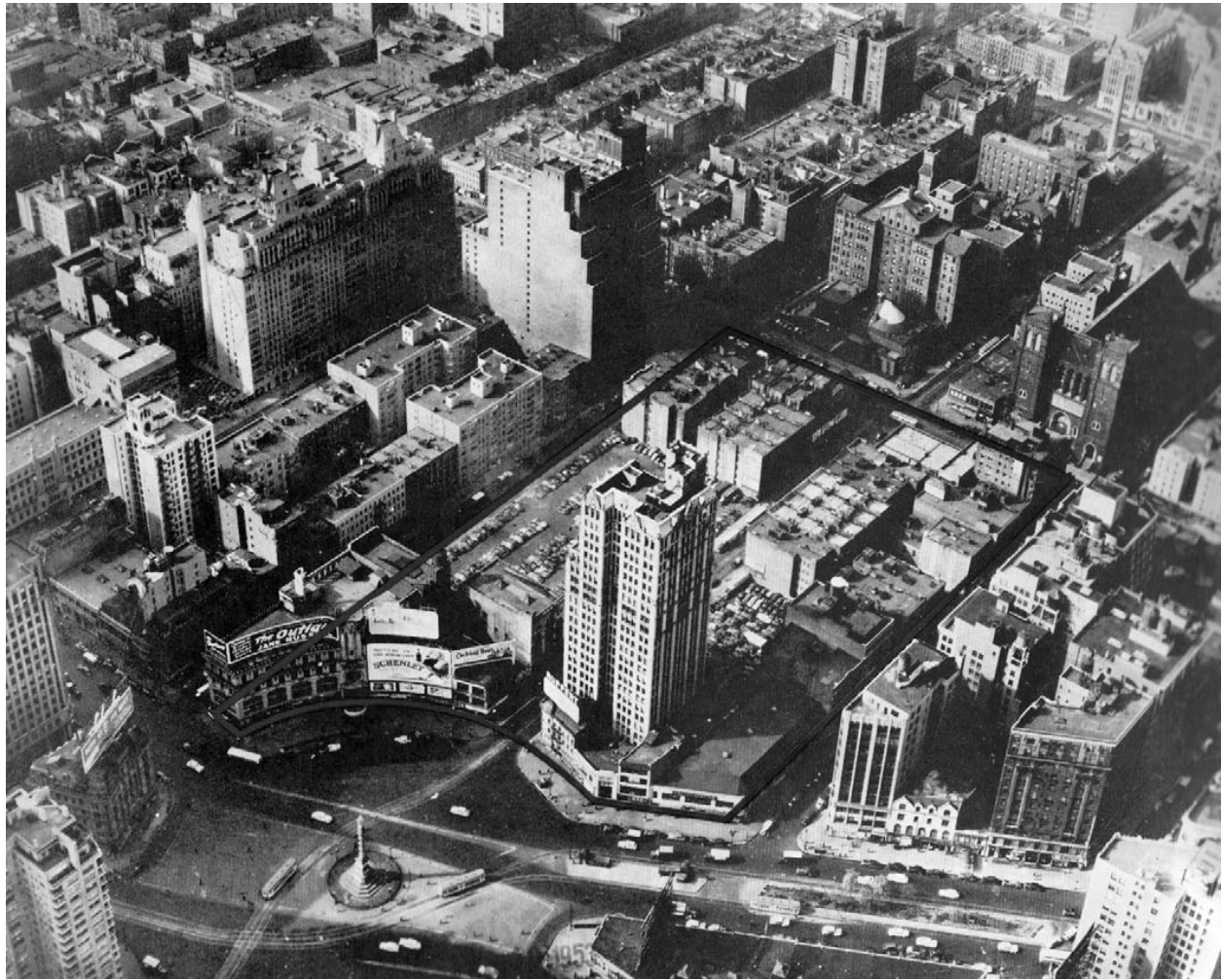
Figure 2. The Columbus Circle area before slum clearance.

The older neighborhoods were conducive to revolts because people frequently barricaded the narrow streets for defense purposes during times of upheaval; the new urban design displaced and dispersed many of these rebellious populations while the wide avenues allowed troops to easily march into certain neighborhoods and restore order. 31 This belief in urban design and its taming effects continued to have currency into the twentieth century and Le Corbusier adopted it in his conceptual expositions. In fact, David P. Jordan has characterized Le Corbusier's proposals of clearing and rebuilding central Paris as "haussmannisme raised to another level." 32