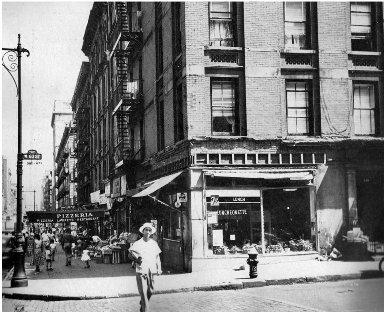
Figure 15. Commercial area in Lincoln Square. Source: Committee on Slum Clearance, Lincoln Square , 46.

commercial areas to be discardable; this did not imply that these stores contributed to slum conditions as the early brochures claimed.