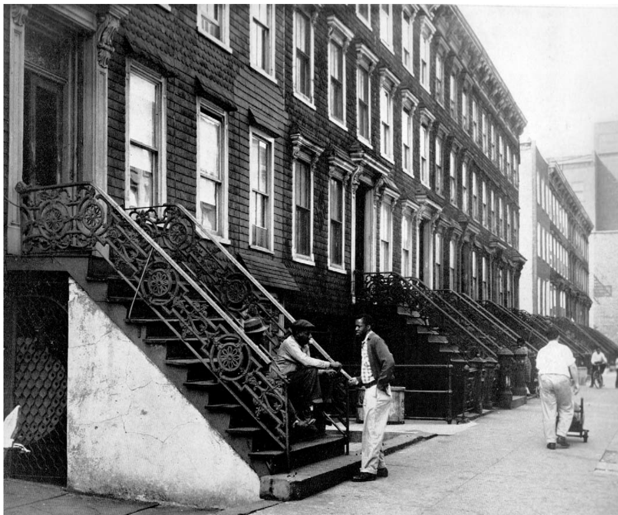
Figure 6. Buildings that were viewed as obsolete in the Pratt Institute slum clearance area.

but nonetheless buildings that were not modern and on their way to obsolescence. 35 These brownstones were too low, too close to each other, and too old to have a place in the modern city. In the caption of another set of photographs representing old London buildings, Sert claimed that slum clearance was an outmoded term that could “merely scratch the surface of London’s problems” and he instead proposed large-scale replanning. 36