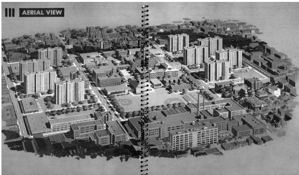
Figure 3. Drawing of the proposed rebuilt Pratt Institute Area in Brooklyn.

development had created in cities like Paris where overcrowding, vehicular congestion, slums, and an inefficient built environment dominated. Le Corbusier likened Paris with “a vision of Dante’s inferno” and proposed that nothing less than its destruction would allow for the achievement of real improvements. In his Plan Voisin, Le Corbusier proposed to bulldoze most of central Paris north of the Seine and replace it with sixty story cruciform towers arranged in an orthogonal street grid surrounded by open green spaces. In his city plans, he advocated a planned functional segregation, so that areas for housing, work, shopping, entertainment, government, and monuments could be all separated. Le Corbusier also wanted to segregate different types of movement for the sake of efficiency; thus, pedestrian traffic would be separated from vehicular traffic and slow-moving vehicles would be required to use different roadways from fast vehicles. Though the great majority of Le Corbusier’s planning schemes were never built since they required immense political resolve and financial resources, many of his theoretical doctrines were adopted and applied by planners and architects around the world. He was behind many of the influential manifestos of the Congr s Internationaux d’Architecture Moderne (CIAM). Le Corbusier became known for urban rebuilding in the form of towers surrounded by gardens. 33