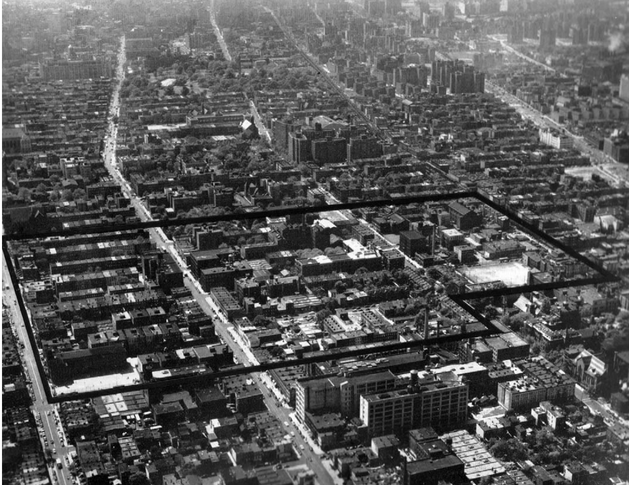
Figure 4. The Pratt Institute Area before slum clearance.

Robert Moses's urban renewal projects followed Le Corbusier's prescriptions of visual order. The gridiron street system was replaced with superblocks. Buildings and functions were separated from each other. Gardens surrounded buildings. Parking facilities were neatly integrated in the site. Playgrounds were placed within meaningful distance from the residential buildings and incorporated into the gardens. The streets surrounding the superblocks were widened so that automobile traffic could flow easier. Stores were limited to specific locations that were separate from the residential towers. The redeveloped sites appeared orderly especially from above and the comprehensive urban design established specific uses for each spatial subdivision. For example, walkways were for tenants walking to and from facilities inside and outside the development; playgrounds were made for children to play under the observation of adults; public benches were placed in specific areas for adults to sit and hang out; parking lots were designated for automobiles to park and for their drivers to walk to the walkways that would take them to their buildings; spaces were separated with fences from each other, so that individuals did not make the mistake of mixing them and using them improperly.