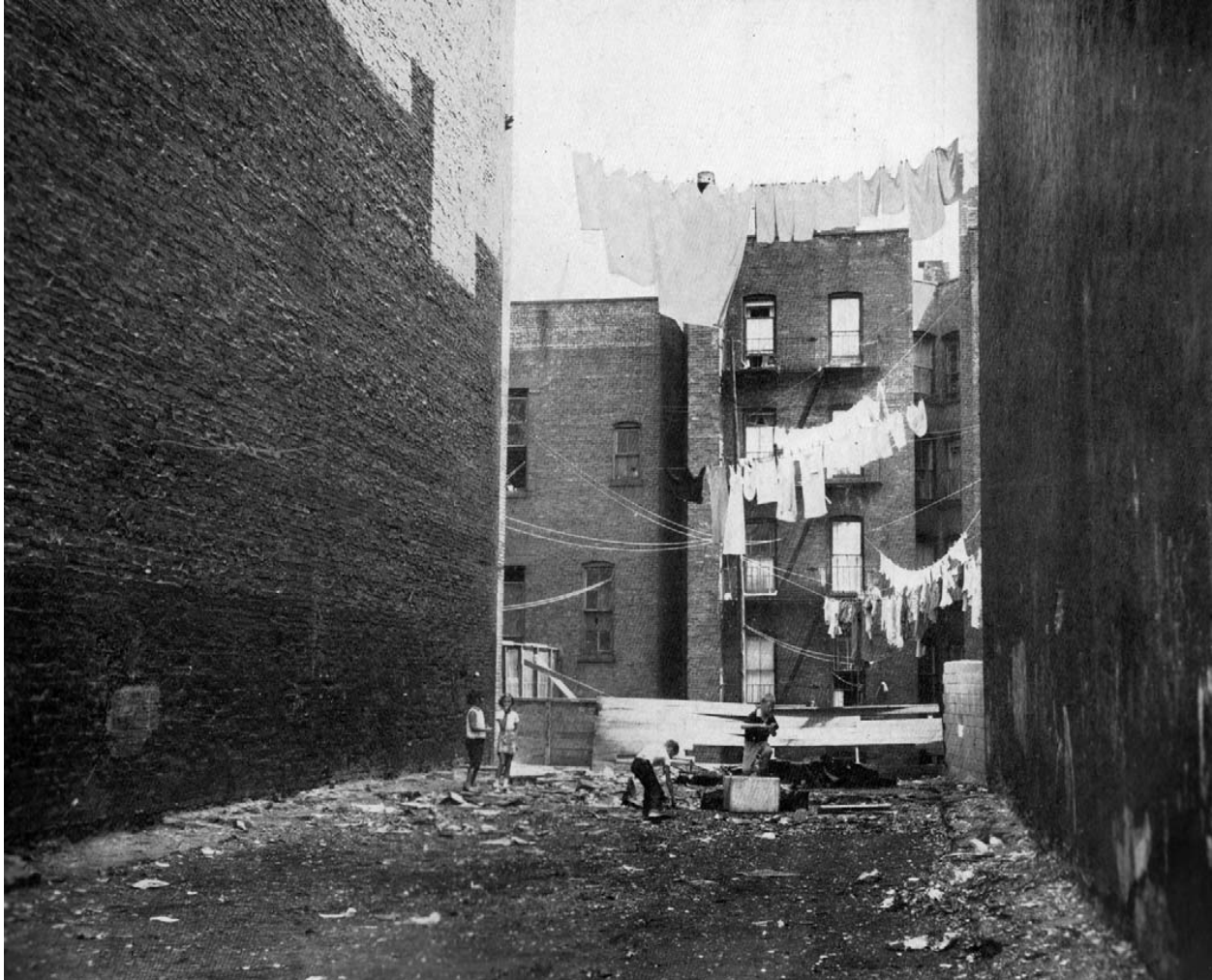
Figure 7. Empty lot with children playing in the Lincoln Square site.

Slum Conditions” section of the brochures, and there are a couple of reasons that can explain their presence; the first is that the photographers were unable to capture images that made the area appear more deteriorated and the second is that they operated under the assumption that the buildings photographed were blighted and on their way to obsolescence. 37 These photographs necessitated the eventual discarding of the term slum and its replacement with “blight.”