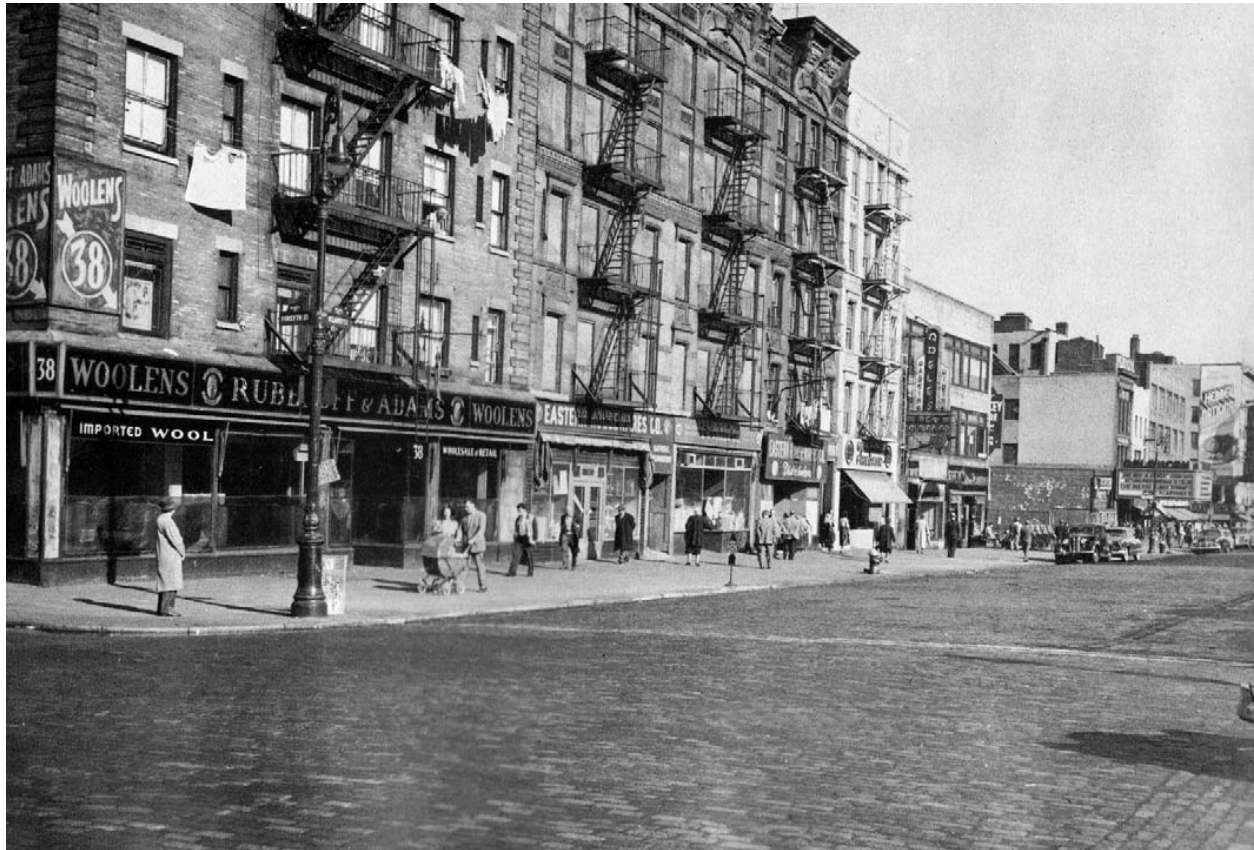
Figure 12. Abandoned building on top of stores in the Delancey Street slum clearance area. Many stores used the buildings above them for storage, but in this case it is unlikely that these stores were able to occupy the entire building. Source: Committee on Slum Clearance, Delancey Street: Slum Clearance Plan Under Title I of the Housing Act of 1949 (New York: The Committee, January 1951), 38.

being the “victims” of the “slum”), the elimination of the blighted area would displace these people and disperse them. In this case, slum clearance was also an instrument of social engineering, though the brochures emphasized the physical problem. 45