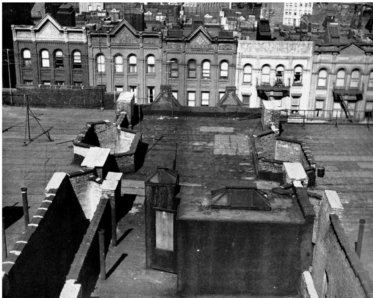
Figure 11. Roofs of buildings in the Morningside - Manhattanville area. Committee on Slum Clearance, Morningside-Manhattanville: Slum Clearance Plan Under Title I of the Housing Act of 1949 (New York: The Committee, September 1951), 40.

the 20 percent mark, meaning that there could be more photographs of them. More than this, despite the fact that abandoned buildings could furnish powerful images of urban decay, many of them were photographed from far away and viewers were not aware of the devastation that closer shots could provide. Once again, abandoned buildings were viewed as natural statements of urban blight, which made for the indiscriminate inclusion of their photographs. They had a similar representational function as empty lots; abandoned buildings were uneconomic and the fact that their owners had not repaired them meant either that the buildings were beyond repair or that their owners were not optimistic about the profitability of these buildings.