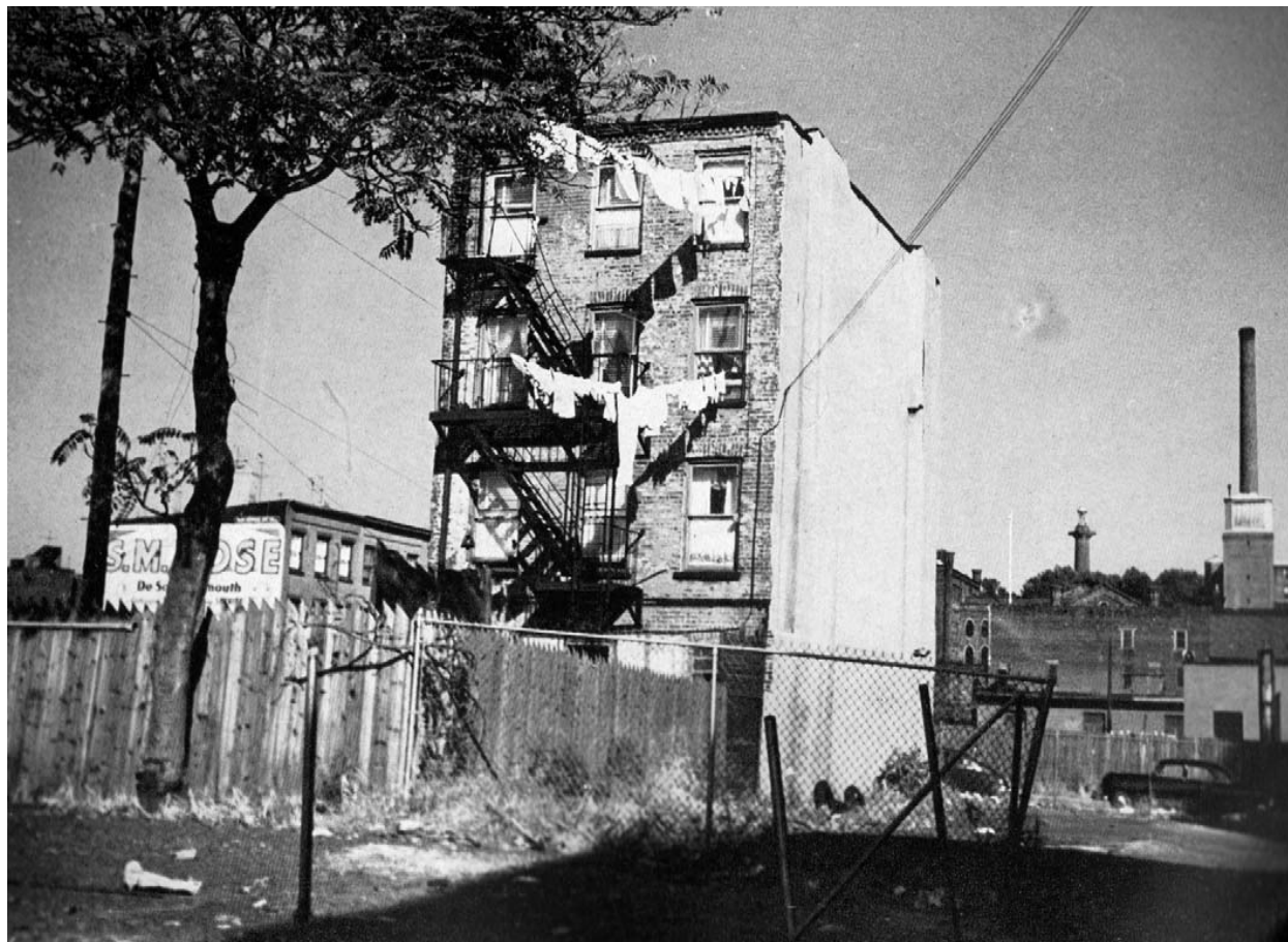
Figure 8. Empty lots surrounding a building in the Fort Greene clearance area.

land coverage, existing zoning, population density, and tenant data. 38 Though the number of photographs varied, the majority of these brochures included five photographs of the “blighted” area. The photographs that displayed “blighted” conditions in the most persuasive manner explored three themes: empty lots, back alleys, and abandoned buildings. 39