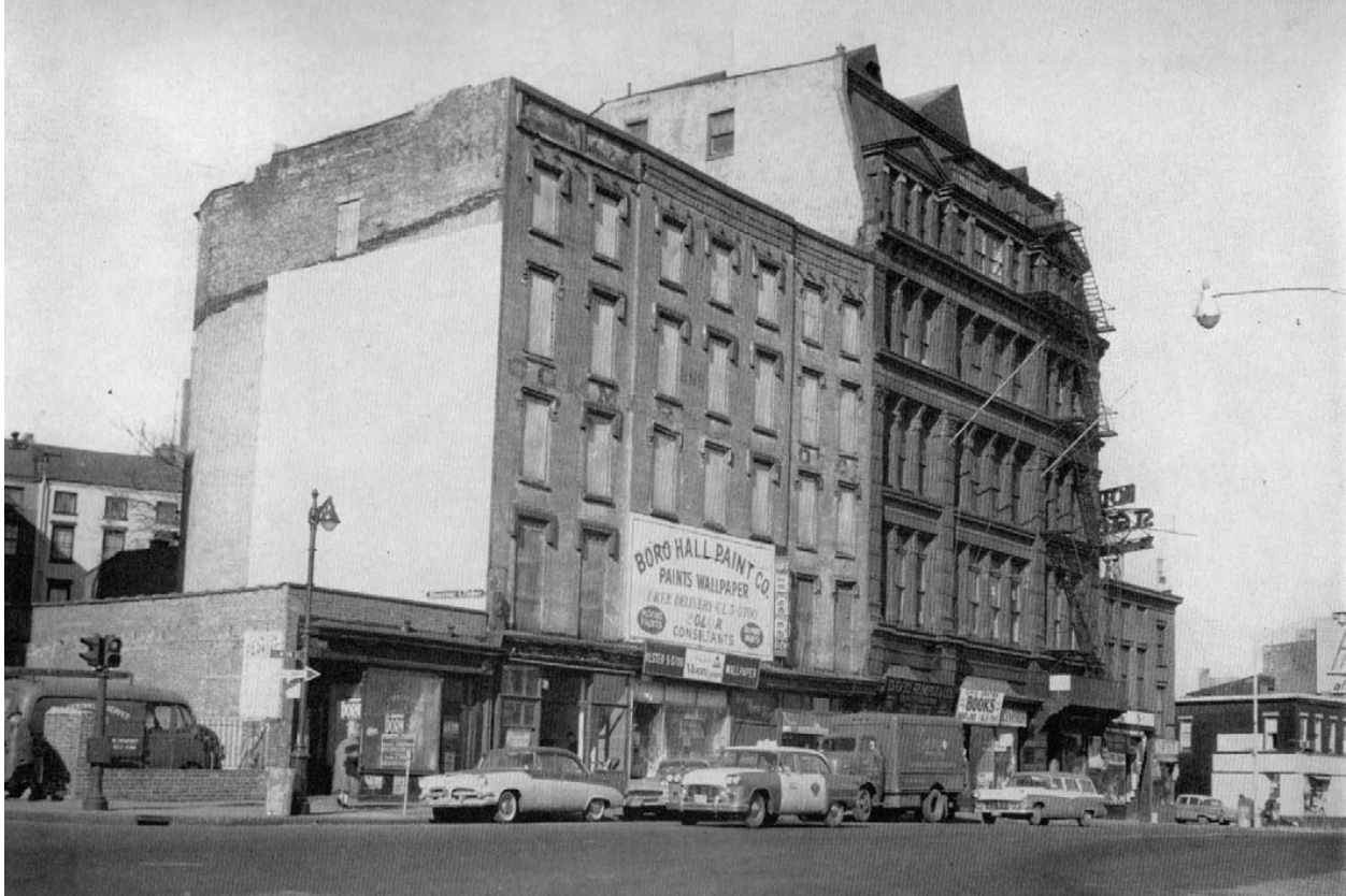
Figure 13. Abandoned building in Cadman Plaza, Brooklyn. Source: Committee on Slum Clearance, Cadman Plaza: Slum Clearance Plan Under Title I of the Housing Act of 1949 as Amended (New York: The Committee, April 20, 1959), 36.

A photograph showing a grocery store with soft drink signs in the ground floor of a brownstone in the Lincoln Square site made the point that commercial establishments existed in residential streets (Figure 14). According to the modernist planning theories of Le Corbusier, such mixture of land uses was unacceptable and made for disorderly, inefficient, and overcrowding conditions. More than this, there is a sign advertising furnished rooms and apartments in the photograph. This implied that some of the buildings had been converted into single-room occupancies, attracting low-income people who were probably transients. A caption for this photograph would ask the question: "Is this a place for a woman and her child?" 47