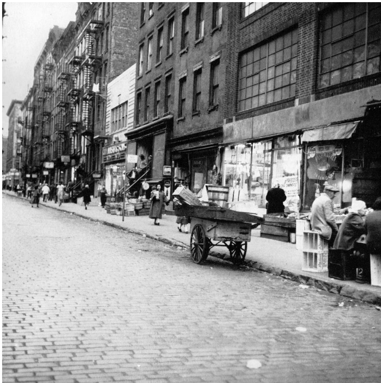
Figure 16. Commercial area in Seward Park.

Law §72-K, which allowed the municipality to acquire through eminent domain areas that were "substandard and insanitary." 50