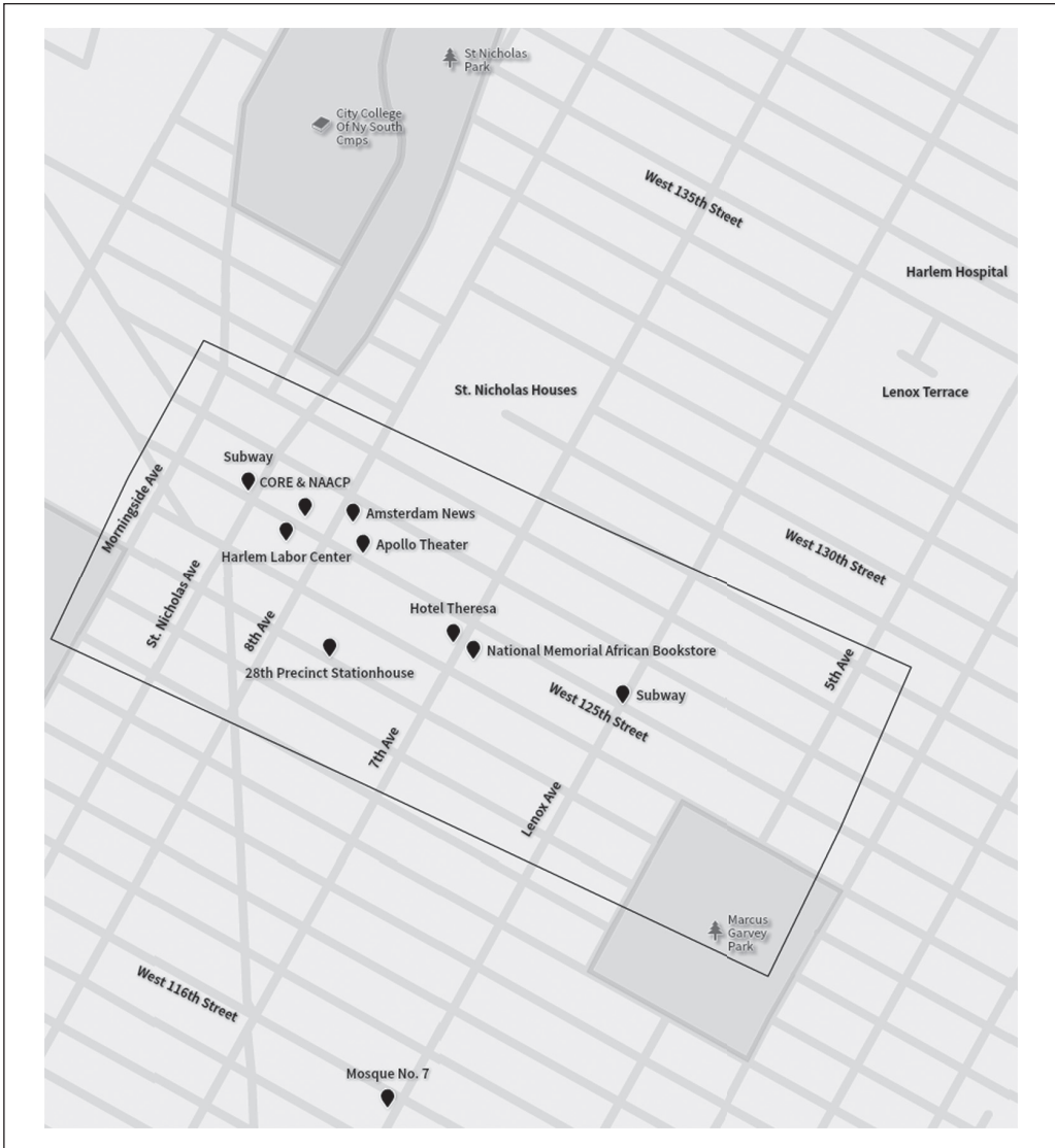
Figure 1. The central business district of Central Harlem. This is where most political gatherings and rallies occurred. The corners of West 125th Street and Seventh Avenue were the most popular locations. However, as these corners filled, various groups and speakers moved north or south on Seventh Avenue or east and west on West 125th Street. Nevertheless, West 125th Street in its entirety was extremely popular with activists setting tables or roaming the sidewalks asking pedestrians to sign petitions, join their organizations, register to vote, take newsletters, or buy newspapers. This is the area where the Harlem Riot of 1964 also began.

Bedford-Stuyvesant in Brooklyn where a peaceful demonstration also escalated into a violent confrontation with the police. 2