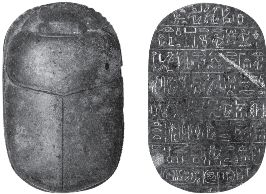
FIG. 1. Heart scarab of King Shoshenq III (courtesy of the Brooklyn Museum).

This article publishes an additional heart scarab, belonging to Shoshenq III, which has only previously been briefly noted (figs 1 and 2). 13 The heart scarab of Shoshenq III is presently in the collection of the Department of Egyptian, Classical, and Ancient Middle Eastern Art of the Brooklyn Museum, Brooklyn, New York (Charles Edwin Wilbour Fund 61.10). It is carved of green stone, most probably serpentinite. 14 This is typical for heart scarabs, since the directive of Spell 30B of the Book of the Dead calls for the use of green stone. 15 The scarab is 80 × 50 × 18 mm, and the surface is finely polished. It is inscribed with