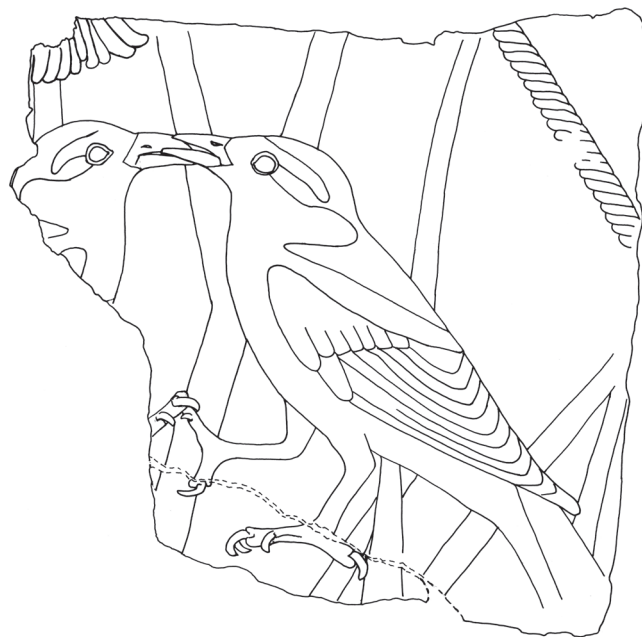
FIG. 1. Relief fragment from the mortuary complex of Userkaf, Saqqara (temp. 6–9–32–1, Cairo Museum). Drawing: Mary Hartley. Reproduced with permission.

IN 1928, Cecil Firth uncovered a large number of relief fragments at the site of Userkaf’s funerary temple at Saqqara. 1 Among these was a small section (c. 14 cm high), now housed in the Cairo Museum (temp. 6–9–32–1), upon which is depicted a pair of birds (fig. 1). The scene is notable not only for the exceptional quality of its carving, but also for the unusual behaviour exhibited by the animals.